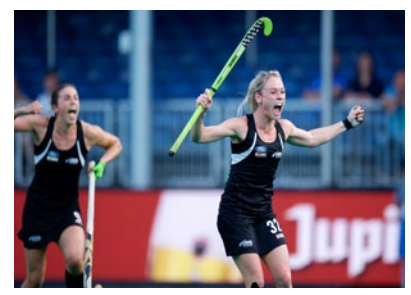
Ellen Hoog - NED FIH - Frank Uijlenbroek